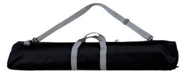
Nylon Carrying Bag